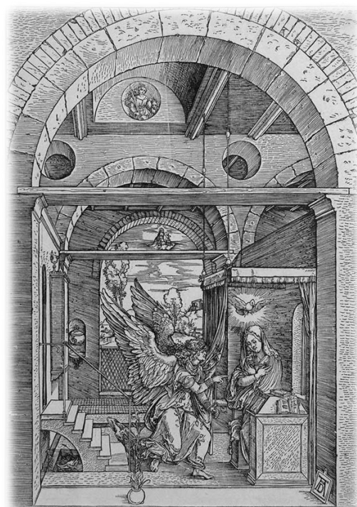
The Annunciation by Albrecht Durer, c. 1503