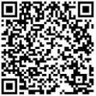
Men of His Word scholarship sign-up

Through a generous donation, men from Emmanuel who sign up for the conference will receive a $50 cash-back scholarship. Only 40 scholarships are available. Register now and pay the registration fee, and once you have attended the event this month, you will receive a $50 reimbursement. Gentlemen, take advantage of this opportunity to attend this excellent conference with your brothers in Christ. Those interested in receiving a scholarship can sign up here or use the provided QR code.