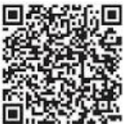
Blood Drive sign-up

Please consider saving the life of a loved one by donating blood this morning (Sunday, February 15) from 7:00 to 10:30 a.m. The Vitalant bloodmobile will be out in the parking lot for you to donate. Tell a friend, family member or neighbor we have this opportunity here on campus. Click here or scan the QR code to register. 90% of all donations stay here in Arizona helping our community.