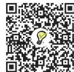
District Convention food and volunteer sign-up

Please consider donating food and/or your time for these events. For more information and to sign-up, click here or scan the QR code. Please sign up by this Friday, June 5.