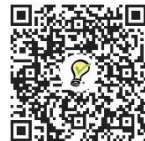
Church campout - registration

There's still room for you to join us next month up north, out of the Phoenix heat. Enjoy cooler weather at our annual church campout on the Mogollon Rim Friday through Sunday, June 26-28. Registration deadline is this Wednesday, June 3; use the provided QR codes to register (or click here ) and make your payment (via online giving - Church Campout Fee ). More details will follow for those who sign up to attend.