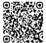
GSBC camper carpool sign-up

Emmanuel Lutheran will be caravanning with Crosswalk Church and Emmanuel will be taking up to two vans to Good Shepherd Bible Camp (GSBC) this summer. If your camper is in need of transportation to and/or from GSBC, reserve their seat today as seats are limited. Click here or scan the QR code for more information and to reserve a seat on the van. Pick-up and drop-off will be at Arizona Lutheran Academy (AZ Lutheran) Sunday morning, July 12, and Saturday evening, July 18. Once information is gathered, there will be follow-up communication on carpool cost and further details. Register for carpool by June 14.