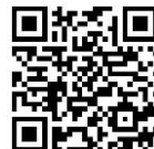
Northwestern Publishing House – Book information

Why God Made Dads is a book that helps kids see dads and fatherhood as one of many of God's good gifts. This is a faith-filled, family-friendly book highlighting God's love, guidance, and protection – along with spiritual nurturing – that kids receive through their fathers. Click here or scan the QR code to learn more about this book and purchase your copy.