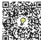
Church campout - registration

Plan your summer escape by attending our annual church campout this June on the cool Mogollon Rim. The 2026 Emmanuel campout is Friday through Sunday, June 26-28. If you have a tent, camper, trailer, or RV (max 30-ft), this is a great time for fun and fellowship. Join us at Woods Canyon Lake campground, about 30 miles east of Payson. The cost is $55 per family or $30 for a single person. Enjoy hiking, group activities for adults and kids, s'mores around the bonfire, and Sunday morning worship.