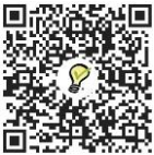
June 10 – Summer Night meal sign-up

Our first summer night will be Wednesday, June 10, 6:00 to 8:00 p.m. Join us for game night – bring your favorite board game or card game, and let's have some fun!