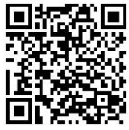
Church campout - Fee payment (via online giving)

Plan your summer escape by attending our annual church campout this June on the cool Mogollon Rim. The 2026 Emmanuel campout is Friday through Sunday, June 26-28. If you have a tent, camper, trailer, or RV (max 30-ft), this is a great time for fun and fellowship. Join us at Woods Canyon Lake campground, about 30 miles east of Payson. The cost is $55 per family or $30 for a single person. Enjoy hiking, group activities for adults and kids, s'mores around the bonfire, and Sunday morning worship.