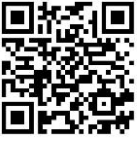
Northwestern Publishing House – Book information