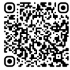
GSBC camper carpool sign-up

Emmanuel Lutheran will be caravanning with Crosswalk Church and Emmanuel will be taking up to two vans to Good Shepherd Bible Camp (GSBC) this summer. If your camper is in need of transportation to and/or from GSBC, reserve their seat today as seats are limited. Click here or scan the QR code for more information and to reserve a seat on the van. Pick-up and drop-off will be at Arizona Lutheran Academy (AZ Lutheran) Sunday morning, July 12, and Saturday evening, July 18. Once information is gathered, there will be follow-up communication on carpool cost and further details. Register for carpool by June 14.