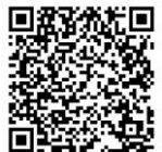
Men of His Word scholarship sign-up

Through a generous donation, men from Emmanuel who sign up for the conference will receive a $50 cash-back scholarship. Only 40 scholarships are available. Register now and pay the registration fee, and once you have attended the event in January, you will receive a $50 reimbursement. (Students who register before December 31, and receive the scholarship, will end up attending for free!) Gentlemen, take advantage of this opportunity to attend this excellent conference with your brothers in Christ. Those interested in receiving a scholarship can sign up here or use the provided QR code.