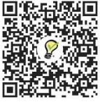
Mother's Day tea – sign up