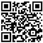
Northwestern Publishing House – Book information

Why God Made Dads is a book that helps kids see dads and fatherhood as one of many of God's good gifts. This is a faith-filled, family-friendly book highlighting God's love, guidance, and protection – along with spiritual nurturing – that kids receive through their fathers. Click here or scan the QR code to learn more about this book and purchase your copy.