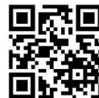
Lutheran Pioneers - Registration

Lutheran Pioneers gives your child the opportunity to learn and grow in a caring, Christian environment. From baking and sewing to building and acting, your child can learn skills for a life of service to God. Pioneers is for kindergarten through grade 6. Visit our website ( elctempe.org/pioneers ) for more information.