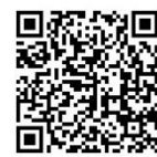
LWMS-GCW - online registration