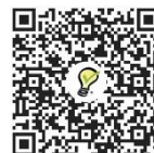
Emmanuel picnic - Sign-up

We are asking for members to contribute cold sides and desserts. More information about this event, volunteer opportunities, and to RSVP can be found at this link: https://www.signupgenius.com/go/30E0A4FADA82DAA8-55229381-2025 , or the provided QR code. Please RSVP by Monday, March 24.